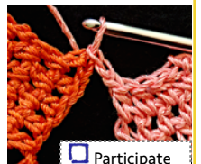
Participate in a CAL (crochet along).