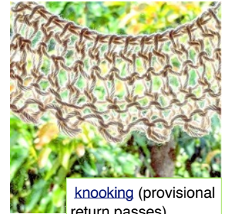
knooking (provisional return passes)