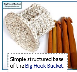
Simple structured base of the Big Hook Bucket .