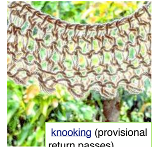
knooking (provisional return passes)